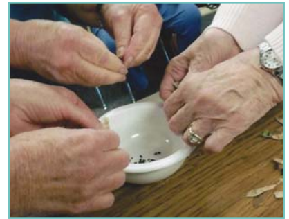
Many hands from Indian Paint Brush Camp, Minidoka Company, helped shell seeds for Brigham's Black Locust Trees