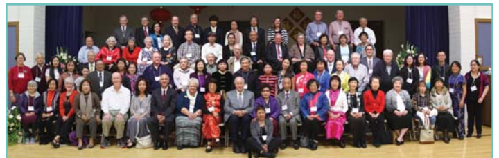
Chinese visitors from Taiwan at Salt Lake 14th Ward LDS Building

The Friday before LDS General Conference, we had a large — I mean a large — group of Chinese visitors from Taiwan at the museum. They are organized similar to DUP, to do as we have done to write, collect, and translate as needed the pioneer histories of their forefathers' stories and migration to this country. Many of them still only speak Chinese and their descendants only speak English. So they are taking on an important work to accomplish. They are so appreciative of what our organization has accomplished, and they hope to do as well. It is their 60th anniversary since the Gospel had been taken to their country. This was a big day for them, and they chose to share it with us at our museum.